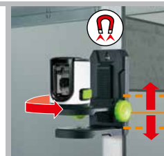
Multi-functional tripod/wall mount