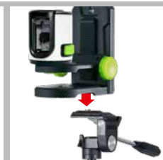
1/4" and 5/8" tripod threads