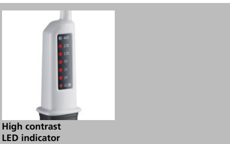
High contrast LED indicator