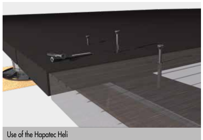
Use of the Hapatec Heli