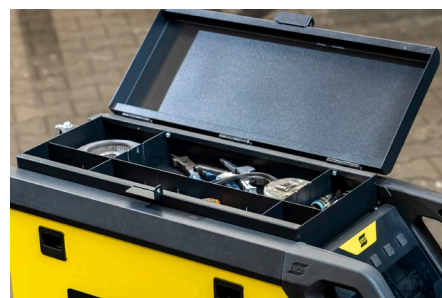
Optional top toolbox for accessories