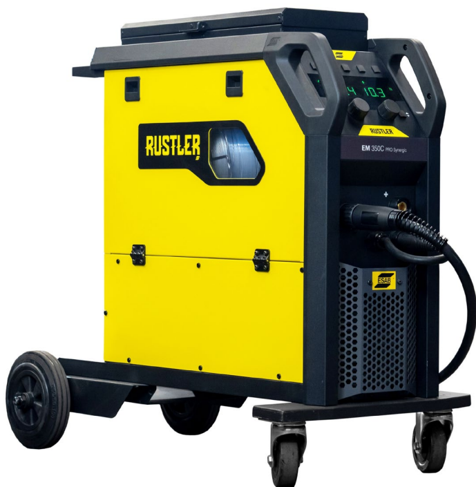
Rustler EM 350C PRO Synergic

Rustler MIG PRO compact welding inverters are your solution of choice for the most common welding challenges. Equipped with the latest inverter technology, they combine low energy consumption with optimized welding performance.