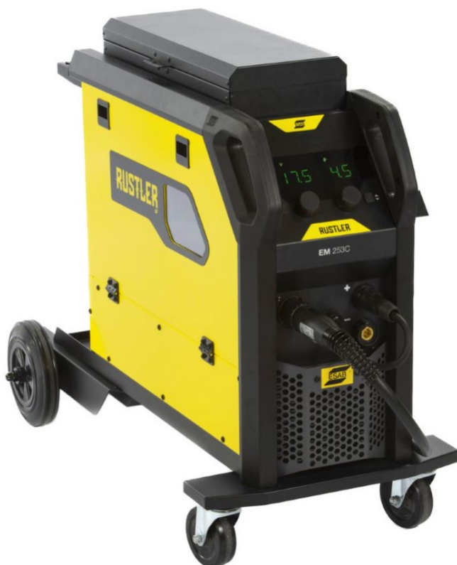
Rustler EM 253C

Rustler MIG compact welding inverters are your solution of choice for the most common welding challenges. Equipped with the latest inverter technology, they combine low energy consumption with optimized welding performance.