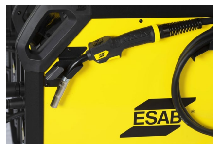
Gun rest and cable management