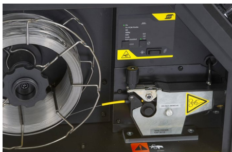
Inside compartment with LED light